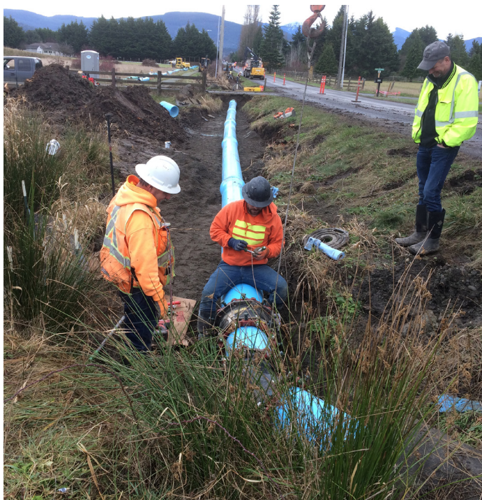
Converting open irrigation ditches to pipeline saves water and reduces the potential for sediment and pollutants to drain into waters also used by salmon.