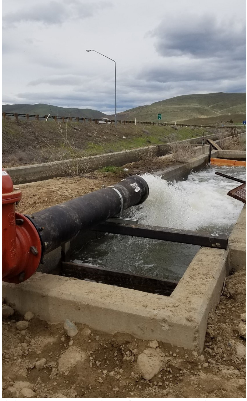
This booster pump was constructed as part of a mitigation project with the Union Gap Irrigation District to address impacts to the mainline pipe that once carried water through the Rattlesnake Ridge Landslide area.