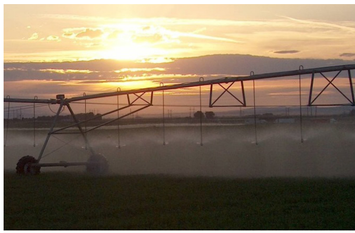
Upgrading to center pivot systems saves water, energy, and time. These are one of the most efficient and effective irrigation systems available.