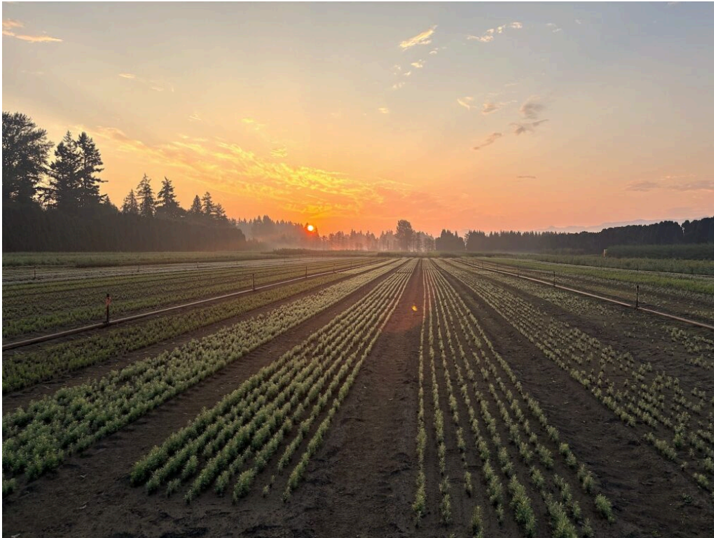
An August sunrise at WACD's Plant Materials Center.

https://wadistricts.org ☼ https://wadistricts.us ☼ https://wacdpmc.org