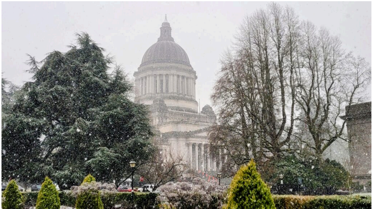
The weather couldn't decide if it was snowing or not for most of Wednesday.