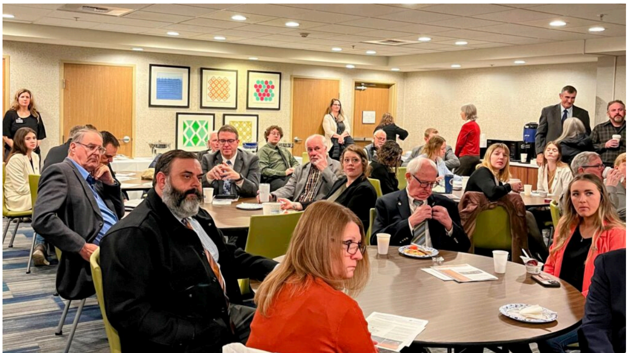
District Supervisors and Staff listening intently.