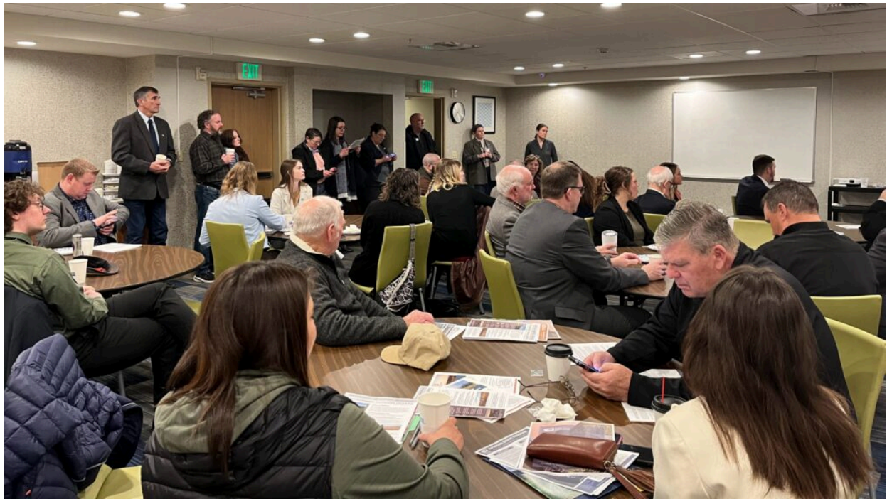
Proof of our best attended Leg Day in recent memory.